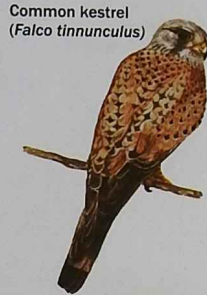
Common kestrel ( Falco tinnunculus )