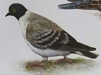
Snow pigeon ( Columba leuconota )