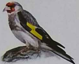
European goldfinch ( Carduelis carduelis )