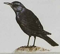
Blue rock thrush ( Monticola solitarius )