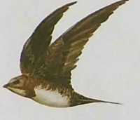
Alpine swift ( Tachymarptis melba )