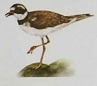
Little ringed plover ( Charadrius dubius )