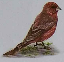
Great rosefinch ( Carpodacus rubicilla )