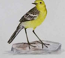
Citrine wagtail ( Motacilla citreola )