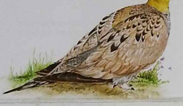
Tibetan sandgrouse ( Syrhaptes tibetanus )