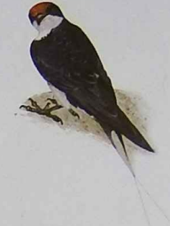
Wire-tailed swallow ( Hirundo smithii )