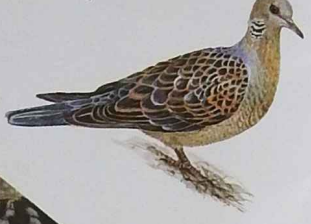
Oriental turtle dove ( Streptopelia orientalis )