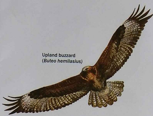
Upland buzzard ( Buteo hemilasius )

More than 300 species of birds have been recorded in Ladakh. This includes the charismatic black-necked crane, bar-headed goose and brown-headed gull. Ladakh's high-altitude wetlands are home to several species that reside or breed here.