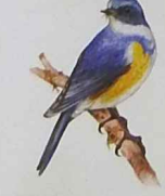
Orange-flanked bush robin ( Tarsiger cyanurus )