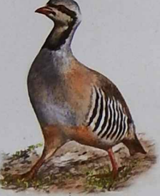
Chukar partridge ( Alectoris chukar )