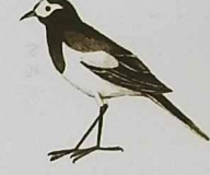
White wagtail ( Motacilla alba )