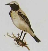
Desert wheatear ( Oenanthe deserti )