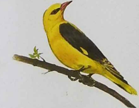
Eurasian golden oriole ( Oriolus oriolus )