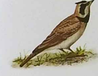
Horned lark ( Eremophila alpestris )