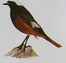
White-winged redstart ( Phoenicurus erythrogaster )