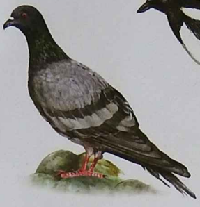
Rock pigeon ( Columba livia )