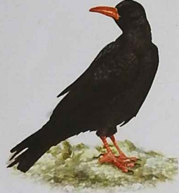
Red-billed chough ( Pyrrhocorax pyrrhocorax )