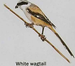
White wagtail ( Motacilla alba )