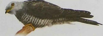
Eurasian cuckoo ( Cuculus canorus )