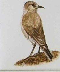
Hume's groundpecker ( Pseudopodoces humilis )