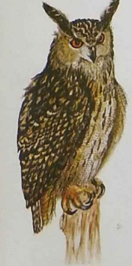
Eurasian eagle owl ( Bubo bubo )