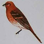
Common rosefinch ( Carpodacus erythrinus )