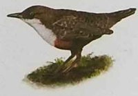
White-throated dipper ( Cinclus cinclus )