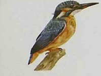
Common kingfisher ( Alcedo atthis )